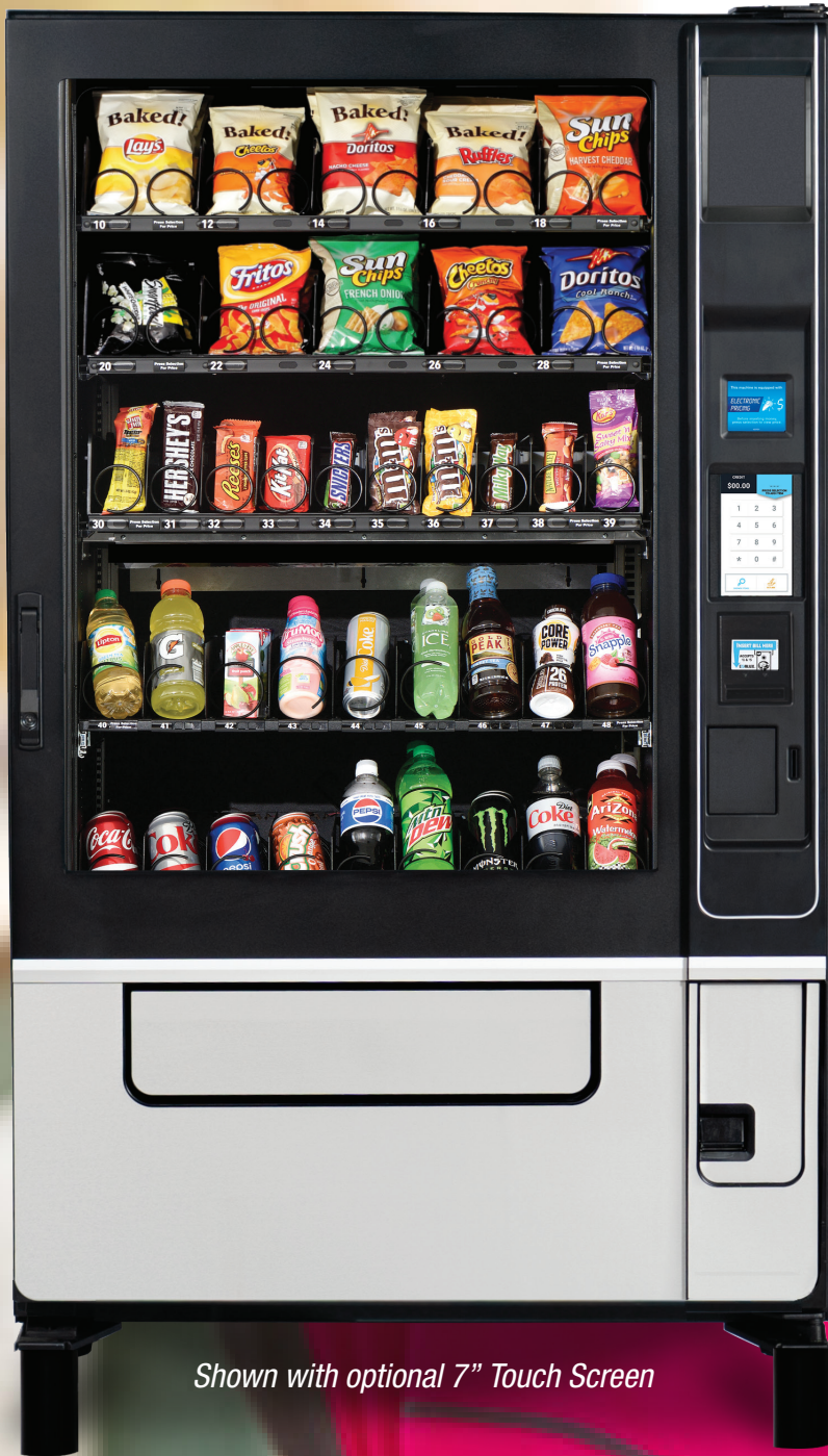
Shown with optional 7" Touch Screen